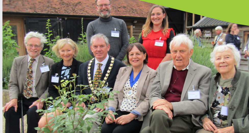
Supporters' Ceremony, June 2019

Digipress Ltd 1A Trident Park, Basil Hill Road Didcot, OX11 7HJ www.digipressltd.co.uk