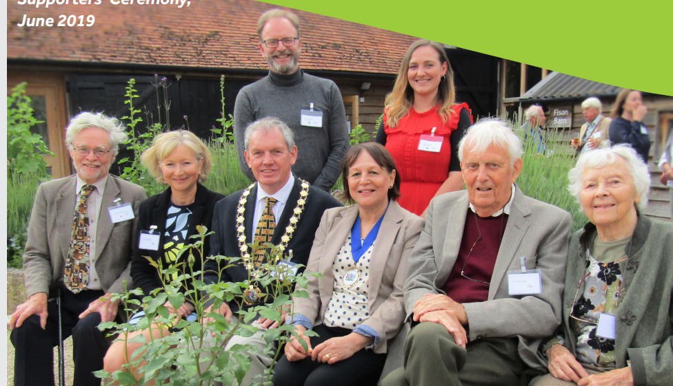
Supporters' Ceremony, June 2019

Digipress Ltd 1A Trident Park, Basil Hill Road Didcot, OX11 7HJ www.digipressltd.co.uk